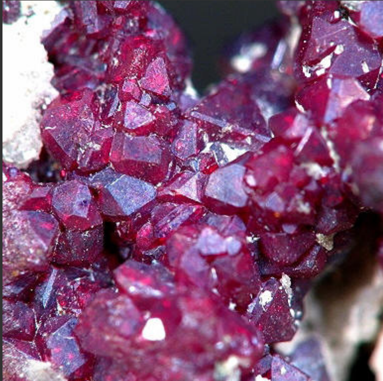
Cuprite - Cornwall, England

We are posting five SALE items everyday on the Daily Five Gallery with discounted prices from 10% to 50% off or More! New Sale items posted everyday M-F so be sure to check back every day!