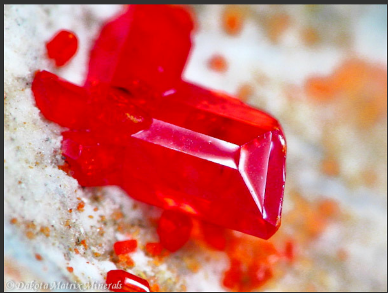
Realgar - Washington

Click on the photo below to see what's new!